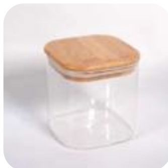
HANA SQUARE JAR WITH WOODEN LID 500ML 6399

200 ml Diameter : 5,7 cm Length : 5,5 cm Height : 8,2 cm Weight : 133 gr