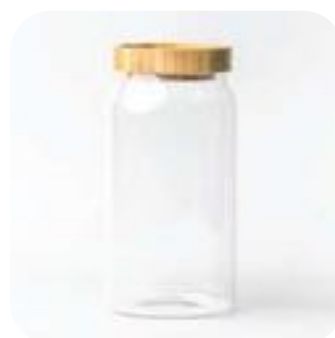
ABIRA BOROSILICATE JAR WITH WOODEN LID - 1200 ML ZQ739

900 ml Diameter : 9 cm Length : 9 cm Height : 17,5 cm Weight : 387 gr