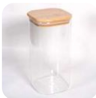
HANA SQUARE JAR WITH WOODEN LID 1500ML 6401

1000 ml Diameter : 9,7 cm Length : 9,5 cm Height : 15,5 cm Weight : 400 gr