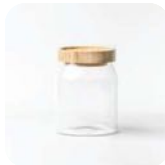
ABIRA BOROSILICATE JAR WITH WOODEN LID - 600ML ZQ737

400 ml Diameter : 9 cm Length : 9 cm Height : 11 cm Weight : 267 gr