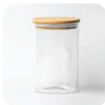
NARA BOROSILICATE JAR WITH WOODEN LID 10*15CM - 1000 ML ZQ732

700 ml Diameter : 10 cm Length : 10 cm Height : 13 cm Weight : 333 gr