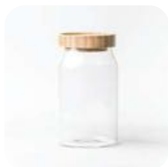
ABIRA BOROSILICATE JAR WITH WOODEN LID - 900 ML ZQ738

600 ml Diameter : 9 cm Length : 9 cm Height : 13 cm Weight : 309 gr