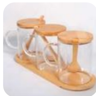
OISHI JAR SET WITH HANDLE 707

1500 ml Diameter : 9,5 cm Length : 9,5 cm Height : 15,5 cm Weight : 400 gr