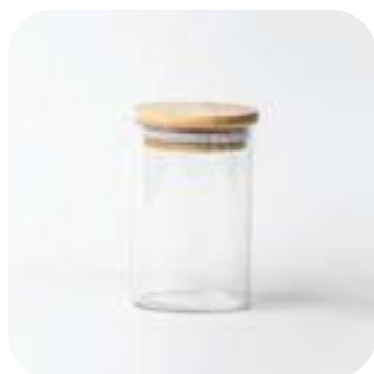
NARA BOROSILICATE JAR WITH WOODEN LID 6.5*10CM - 300 ML ZQ720

300 ml Diameter : 6,5 cm Length : 6,5 cm Height : 10,7 cm Weight : 133 gr