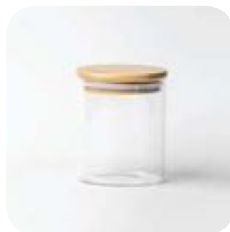
NARA BOROSILICATE JAR WITH WOODEN LID 8.5*10CM - 500 ML ZQ725

300 ml Diameter : 6,5 cm Length : 6,5 cm Height : 10,7 cm Weight : 133 gr