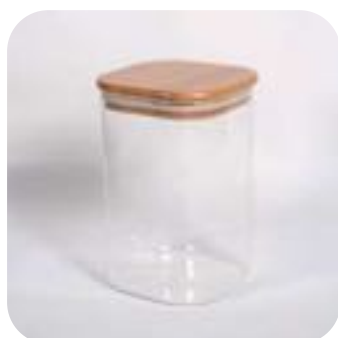
HANA SQUARE JAR WITH WOODEN LID 1000ML 6400

500 ml Diameter : 9,7 cm Length : 9,5 cm Height : 10,5 cm Weight : 300 gr