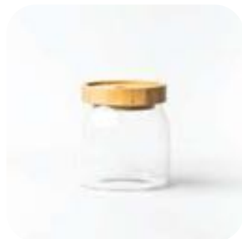
ABIRA BOROSILICATE JAR WITH WOODEN LID - 400 ML ZQ736

400 ml Diameter : 9 cm Length : 9 cm Height : 11 cm Weight : 267 gr