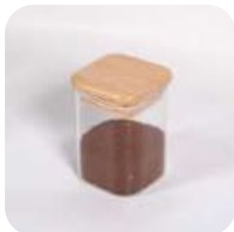
HANA SQUARE JAR WITH WOODEN LID 200ML 6396

200 ml Diameter : 5,7 cm Length : 5,5 cm Height : 8,2 cm Weight : 133 gr