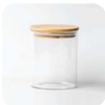
NARA BOROSILICATE JAR WITH WOODEN LID 10*12CM - 700 ML ZQ731

500 ml Diameter : 8,5 cm Length : 8,5 cm Height : 10,7 cm Weight : 237 gr